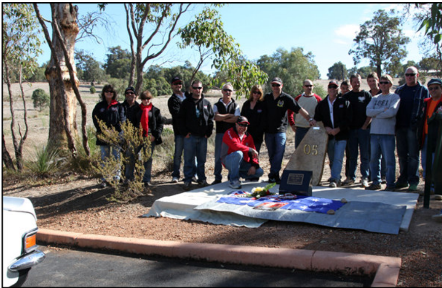
Peter Brock Memorial Unveiling 2010