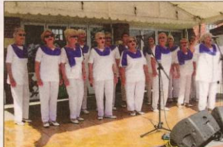
The Voices in Harmony group entertains patrons on the stage.