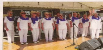
The Voices in Harmony group entertains patrons on the stage.

Pictures and article courtesy of The Harvey Waroona Reporter.